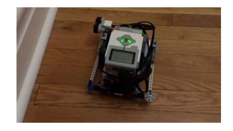
Play the video to see how the robot should move

STEP 2: Repeat everything in a loop that runs forever (you can change the exit condition of the loop if you wish by switching out the loop block)